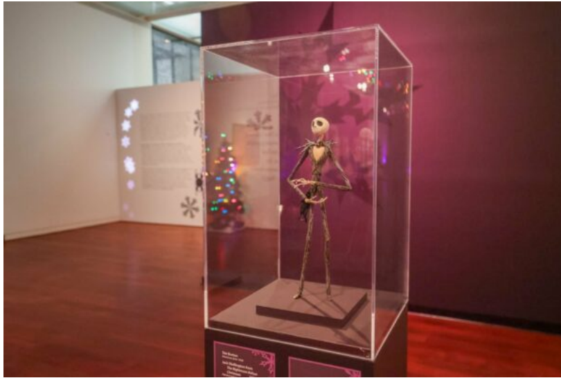
“Dreamland | Tim Burton’s The Nightmare Before Christmas ” on vi

Click these links to learn about all current and upcoming Austin-area exhibitions.