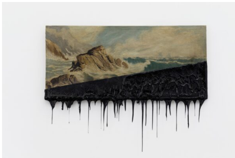
Minerva Cuevas, "Horizon II," 2016, oil on canvas dipped in chapopote, 21.65 x 27.95 x 1.97 inches. Artwork © Minerva Cuevas.

Unbreakable: Feminist Visions from the Gilberto Cárdenas and Dolores Garcia Collection will be on view at the Blanton through Sunday, December 3, 2023.