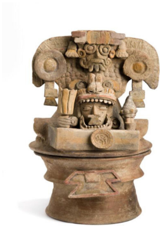
Teotihuacan-Style Censer with Ancestor ceramic with post-fire pigment, 11 × 9 × Museum of Art, purchased with funds pr (M.2010.115.1019a-b)

At the end of August, The Blanton opened its fall exhibition Forces of Nature: Ancient Maya Art from the Los Angeles County Museum of Art . The show, which features more than 200 objects from LACMA's collection, traveled to three venues in China in 2018 and 2019. The Blanton is the first and only museum in the U.S. to present the show.